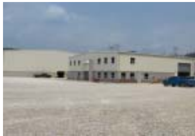
Rumpke Recycling opened for business earlier this year providing residential waste pick-up as well serving as a drop off point for recycling of plastic, paper and