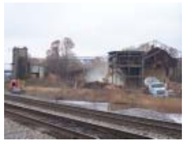
In late fall of 2006, crews tore down the old Carlyle Tile plant along US Route 52 in Coal Grove. The site is slated for use in an upcoming industrial development by McGinnis, Inc.